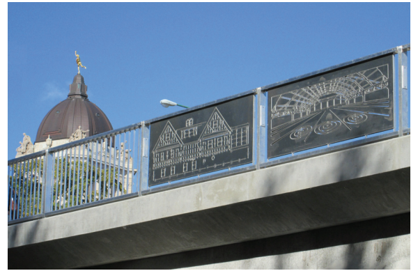
Gateway Art Panels

Watch for information about an upcoming celebration of this remarkable new artwork. Details coming soon to www.winnipegarts.ca .