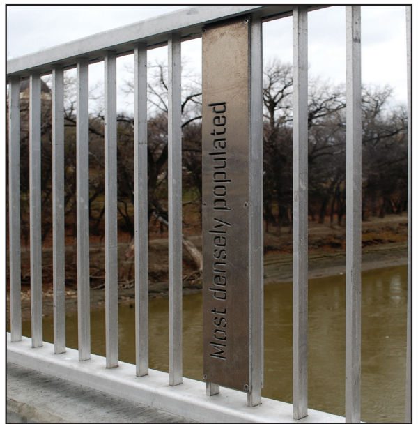
Inscribed Handrail Picket