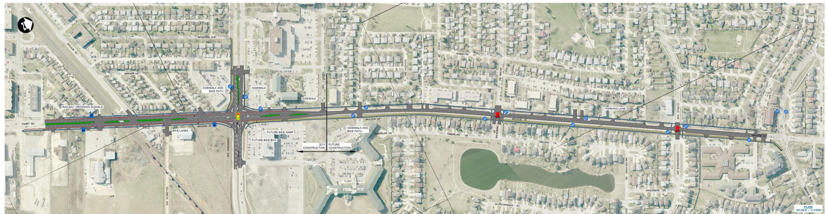
PLAN SCALE - 1:11000