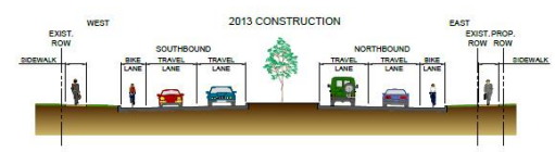
TYPICAL SECTION OF PANET ROAD/MOLSON STREET MUNROE AVENUE TO KIMBERLY AVENUE