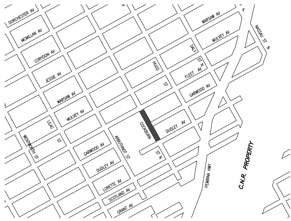
COCKBURN STREET NORTH FROM DUDLEY AVENUE TO FLEET AVENUE