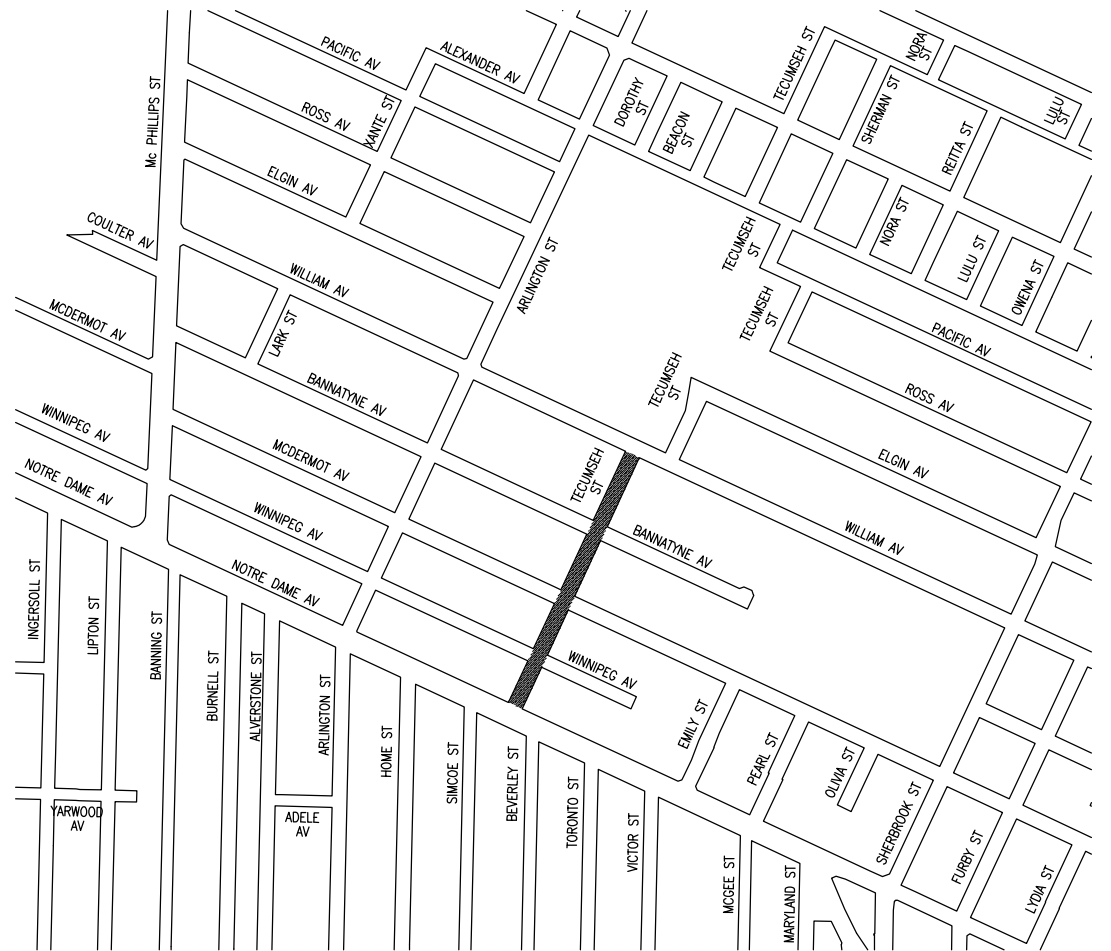
TECUMSEH STREET FROM NOTRE DAME AVENUE TO WILLIAM AVENUE