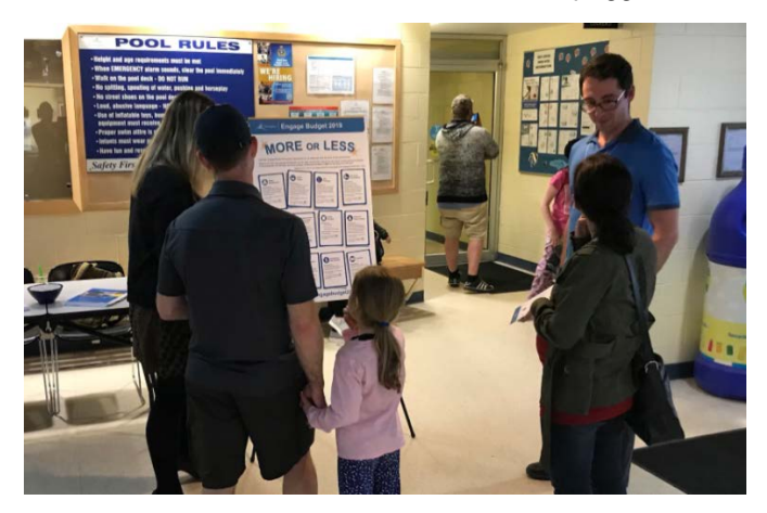
Interactions at a pop-up event