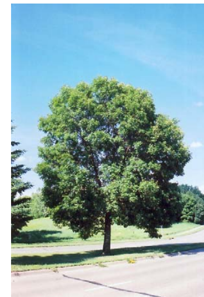
Green Ash Tree