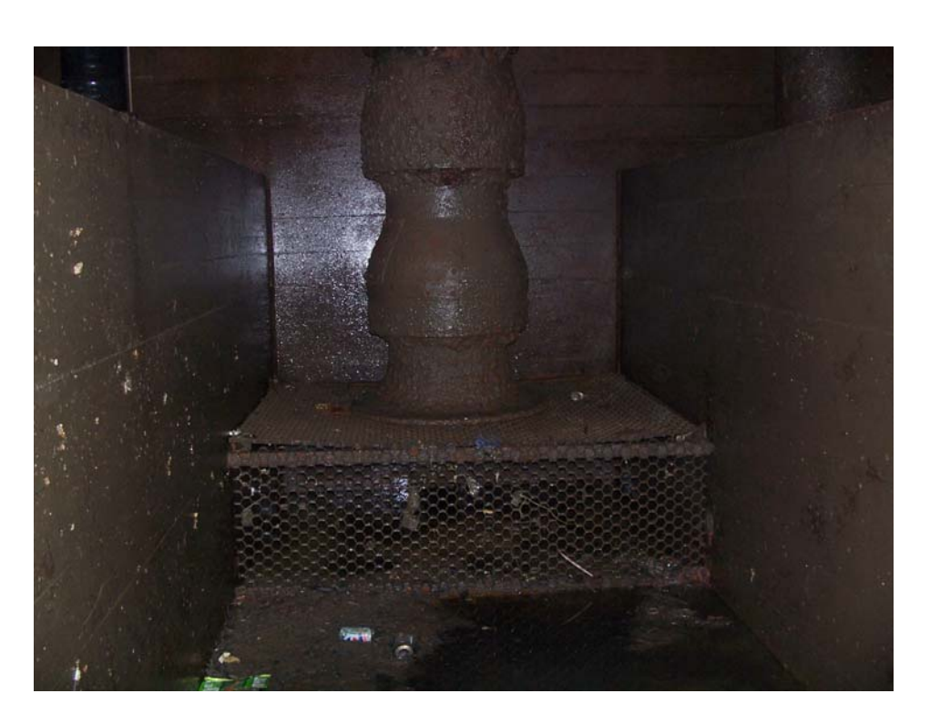
Photo 7 – Existing Pumps and Divider Walls to be Removed (Wetwell)