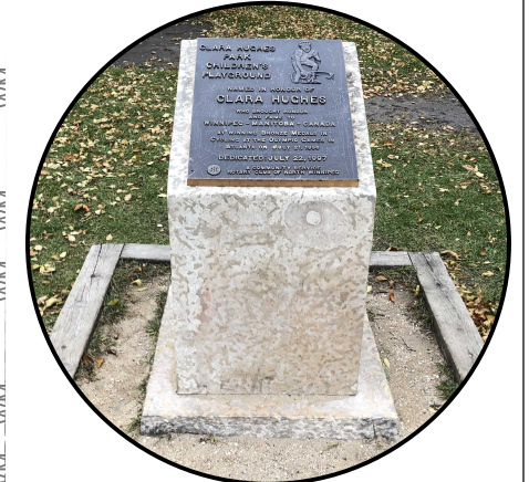
EXISTING MONUMENT TO BE MOVED