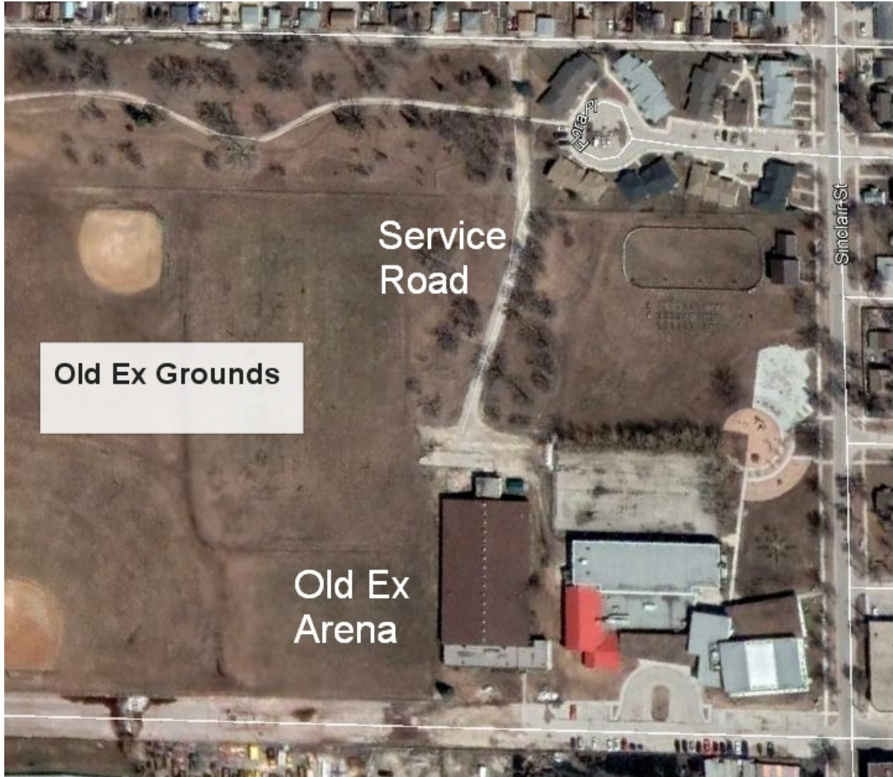
Project Site Plan- Existing Conditions