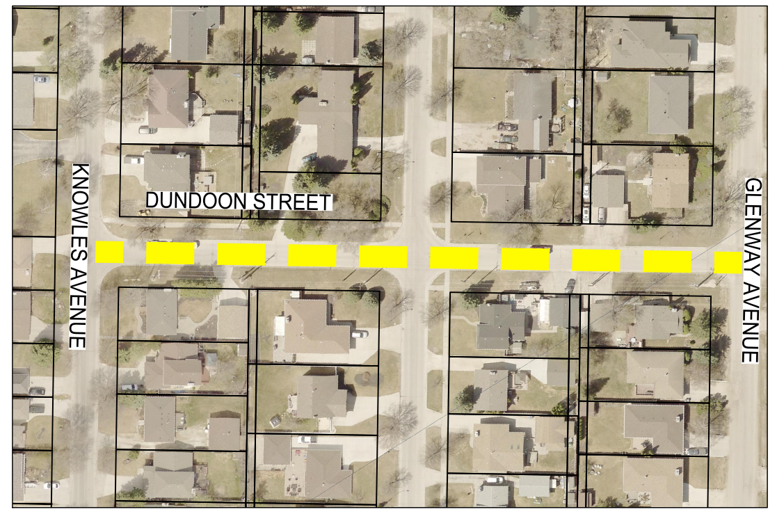
DUNDOON STREET - GLENWAY AVENUE TO KNOWLES AVENUE