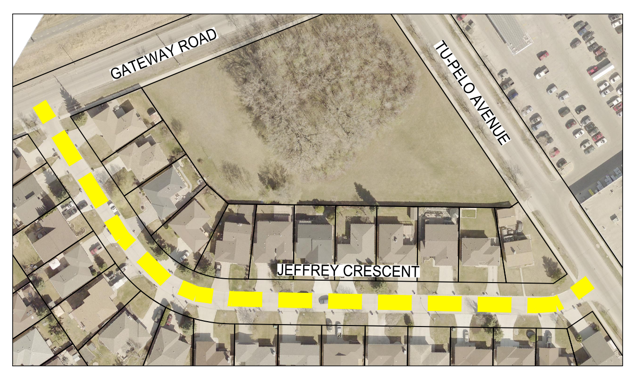
JEFFREY CRESCENT - TU PELO AVENUE TO GATEWAY ROAD