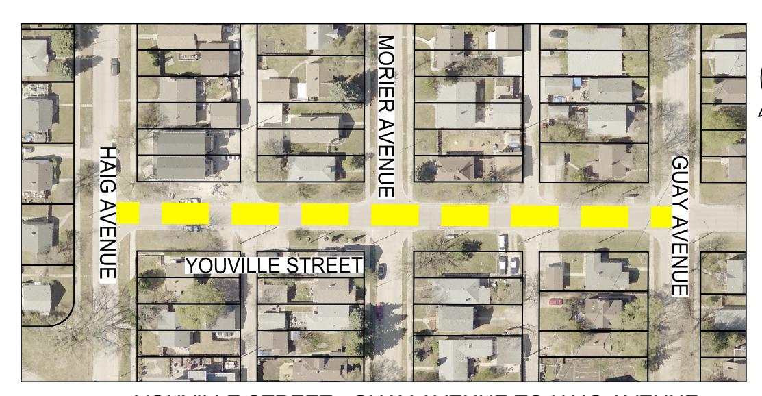
YOUVILLE STREET - GUAY AVENUE TO HAIG AVENUE SCALE 1:1500