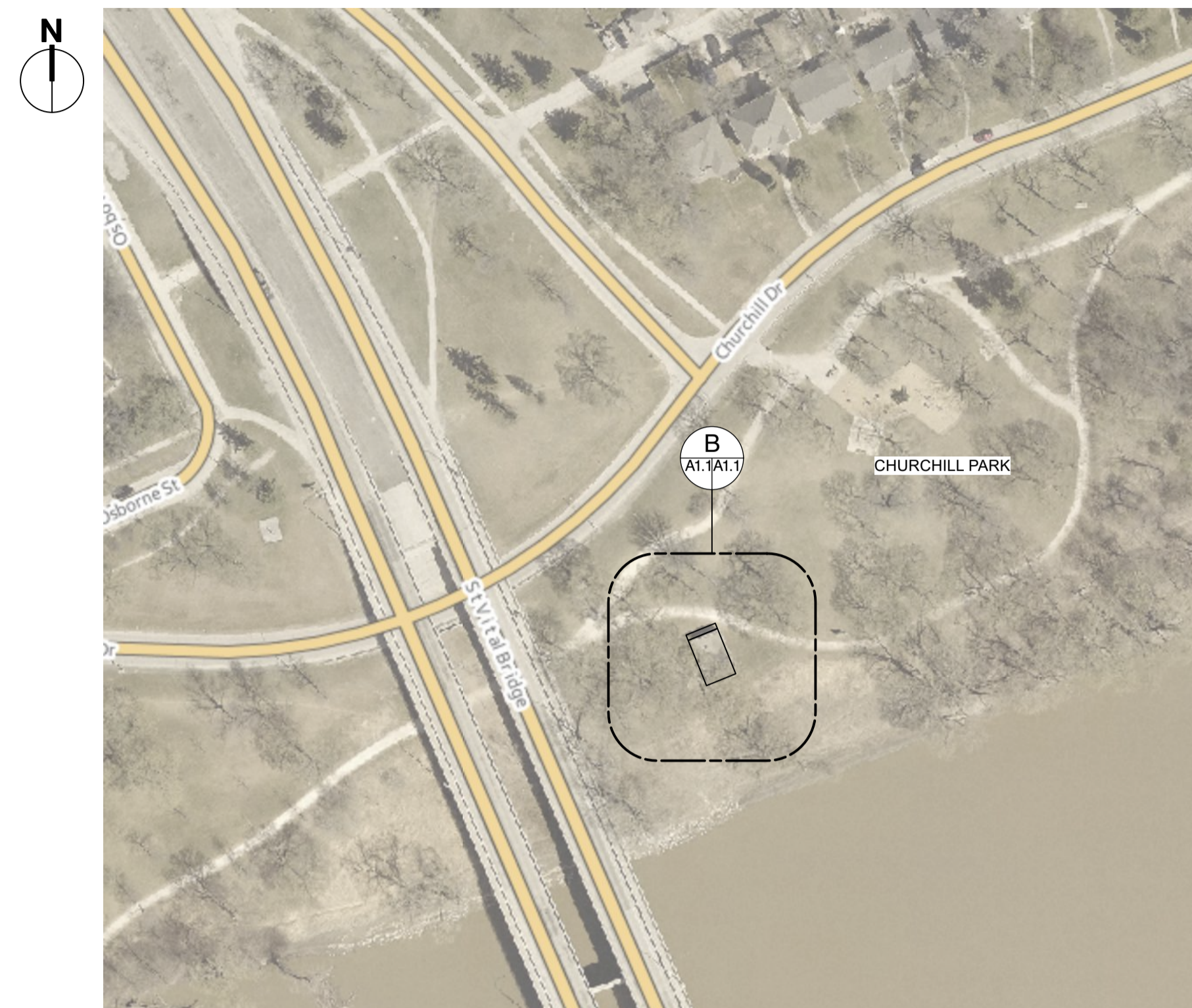
A LOCATION PLAN A1.1/A1.1 SCALE NTS