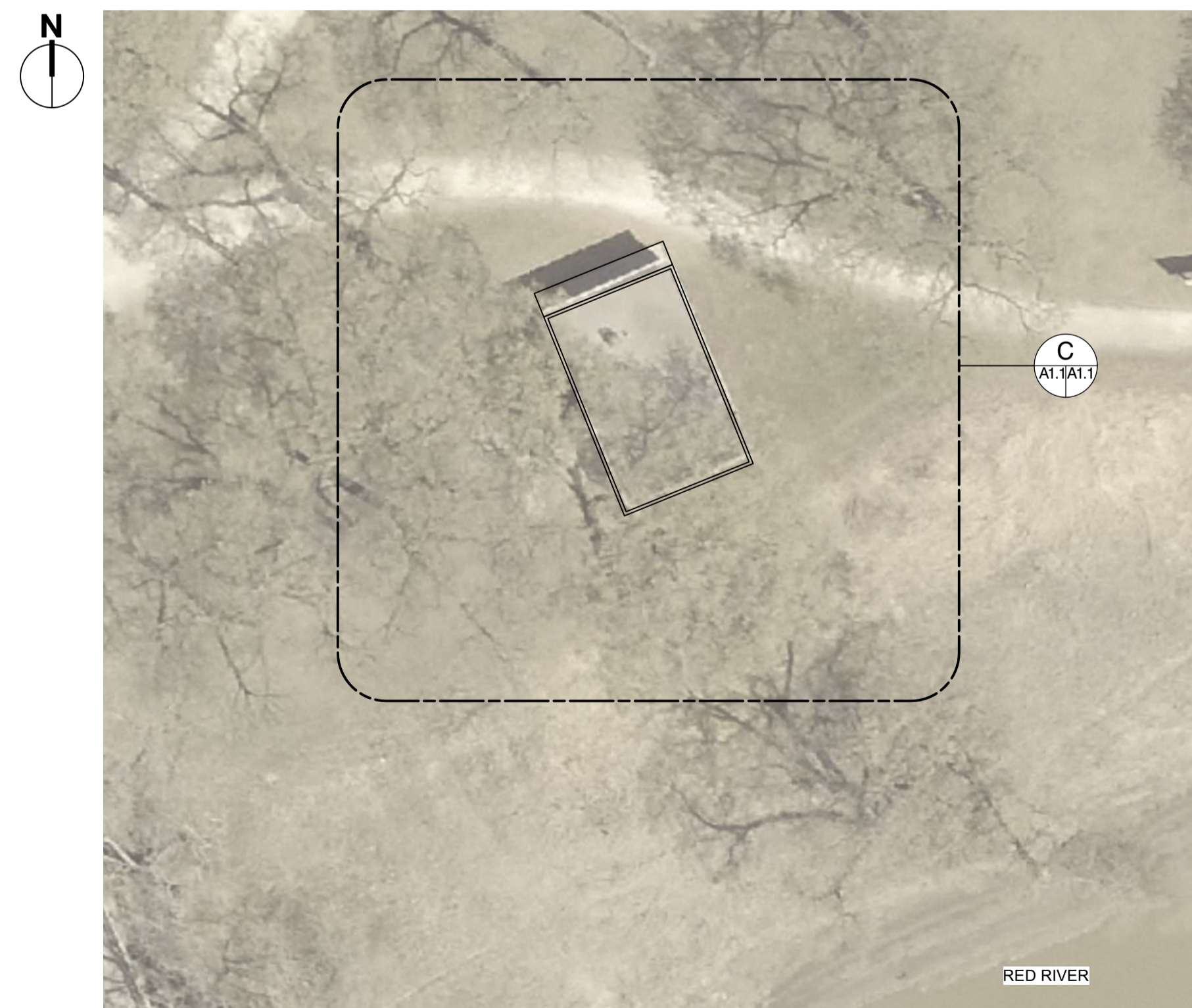
A KEY PLAN A1.1/A1.1 SCALE NTS