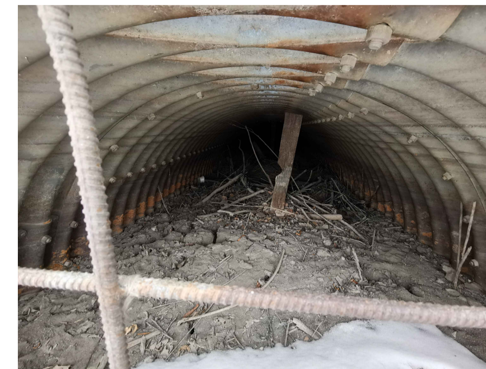
LOOKING INTO PIPE FROM OUTLET DATE 2021-03

NOTE: CHAINAGES SHOWN ARE ALONG CL EXISTING OUTFALL