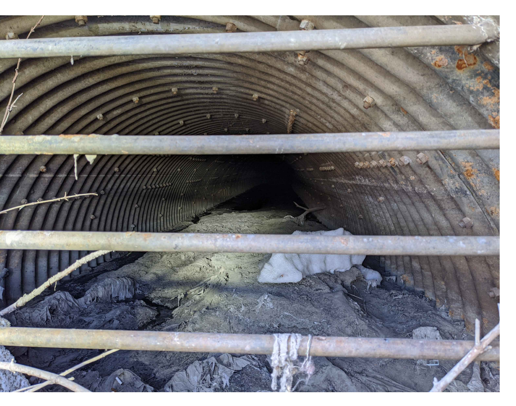
LOOKING INTO PIPE FROM OUTLET DATE 2021-03