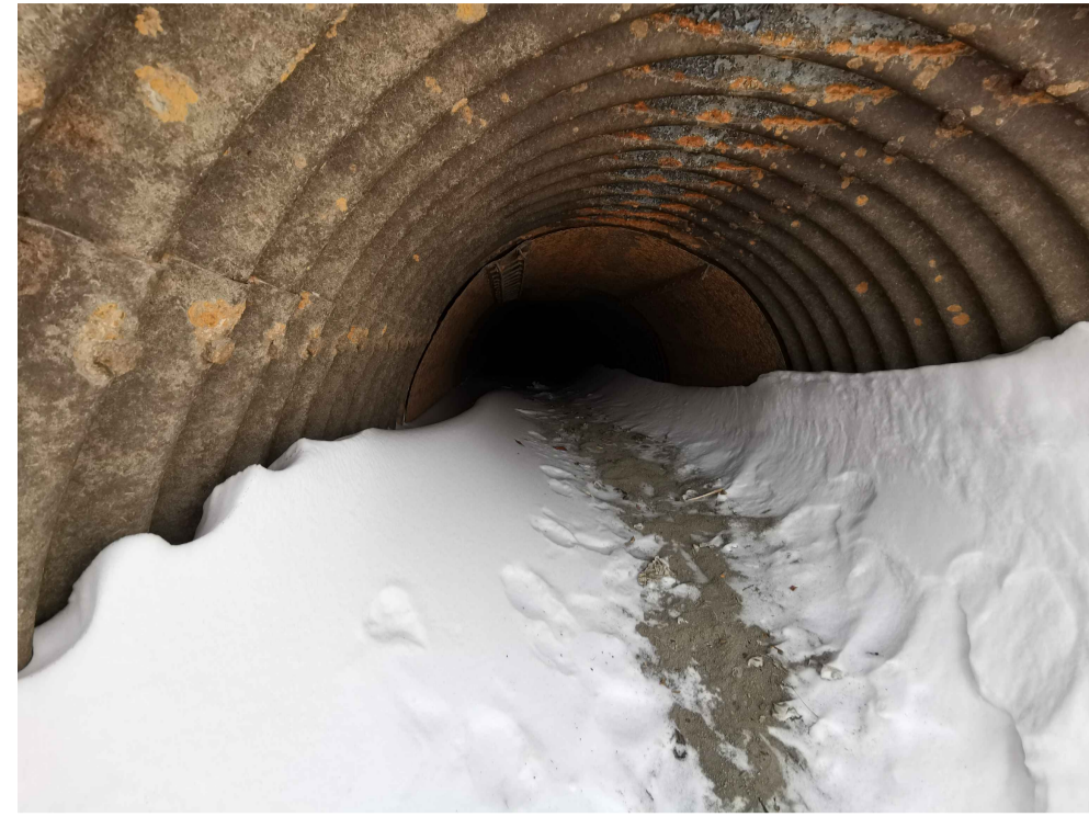
LOOKING INTO PIPE FROM OUTLET DATE 2021-03