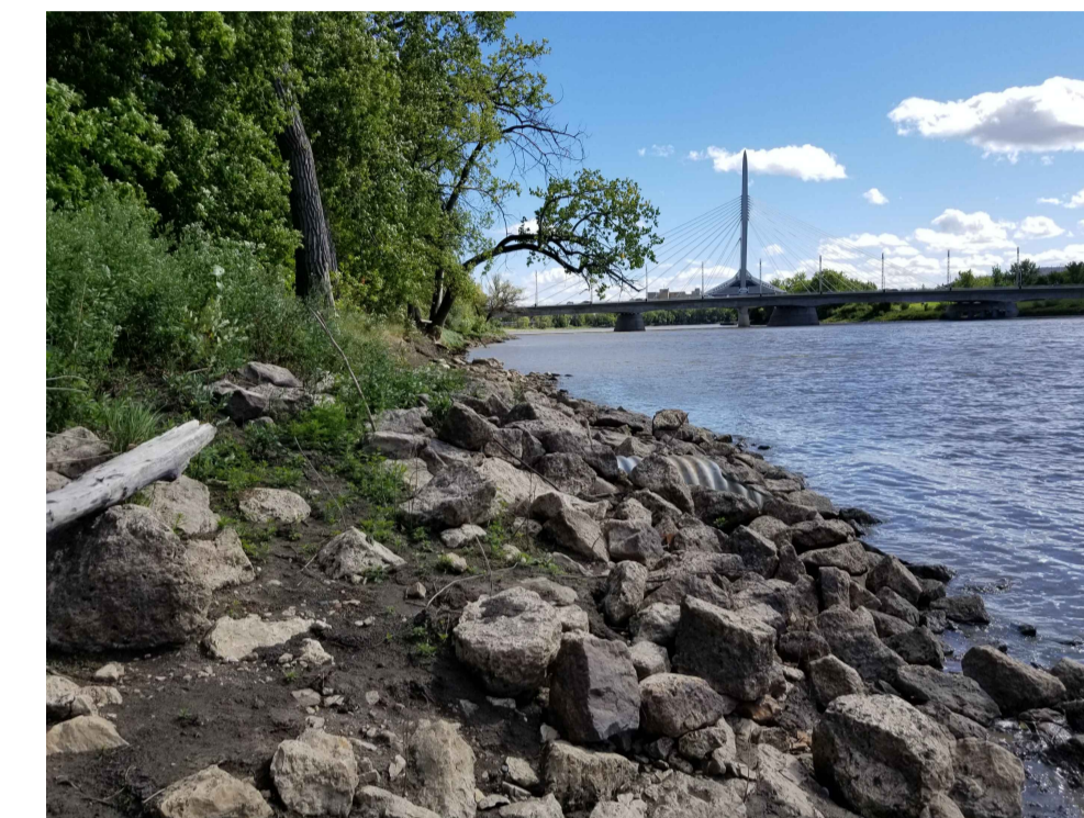
LOOKING SOUTH ALONG SHORELINE DATE 2020-09