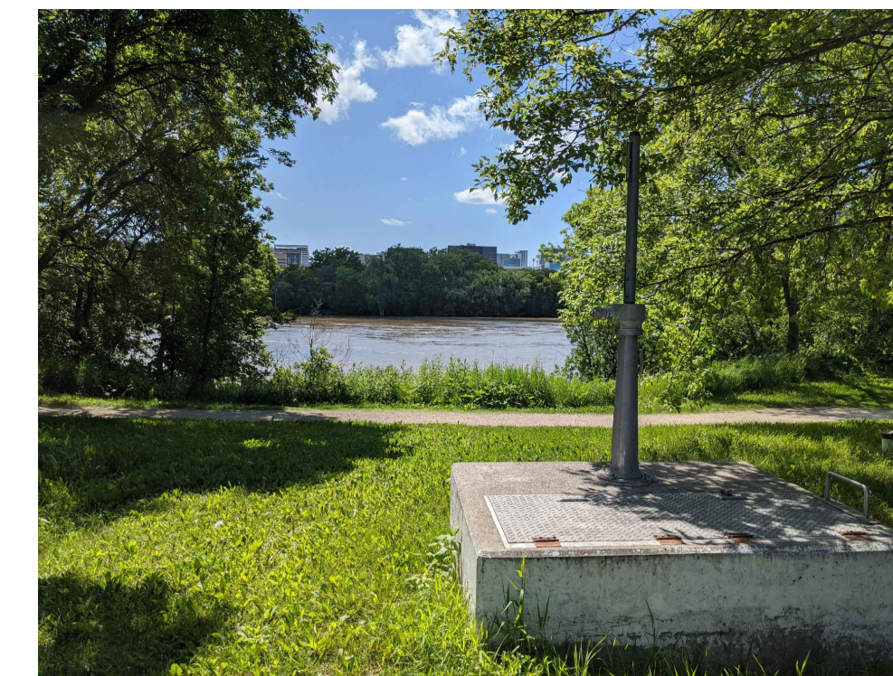
LOOKING WEST FROM CHAMBER DATE 2020-07