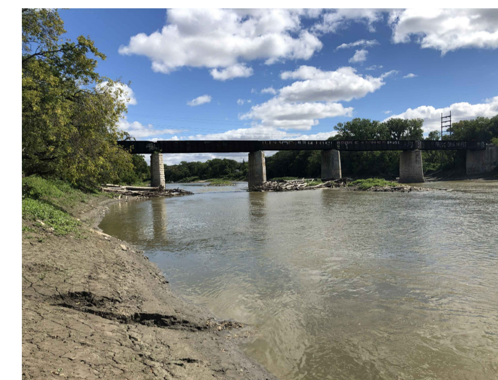
LOOKING EAST ALONG SHORELINE DATE 2020-10